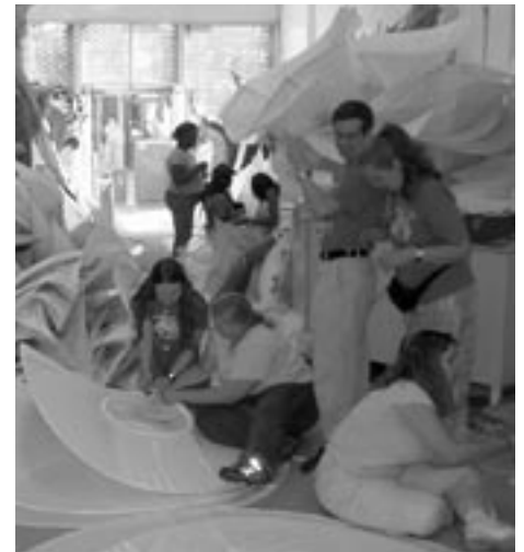
Last minute costume preparations in Mahogany Arts' workshop. OSU student interns helped to build many of the costumes for carnival.