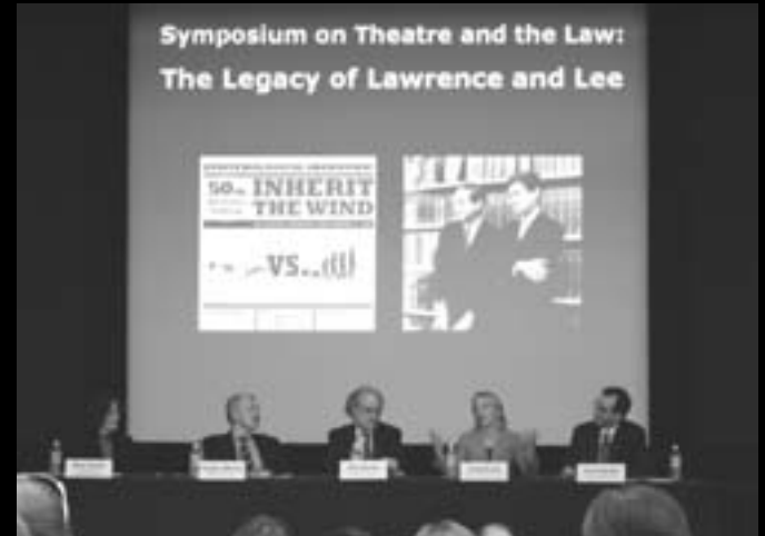
Spring 2005 Symposium on Theatre and the Law: The Legacy of Lawrence and Lee held in honor of the 50 th Anniversary of Inherit the Wind .