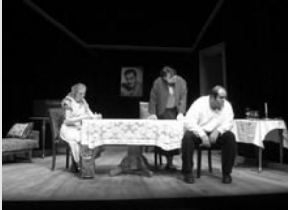
The Glass Menagerie , Spring 2005, Lima Campus