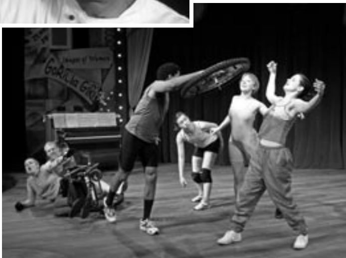
MFA actors in the new work Vaudeville performing the "Slow Motion Race".