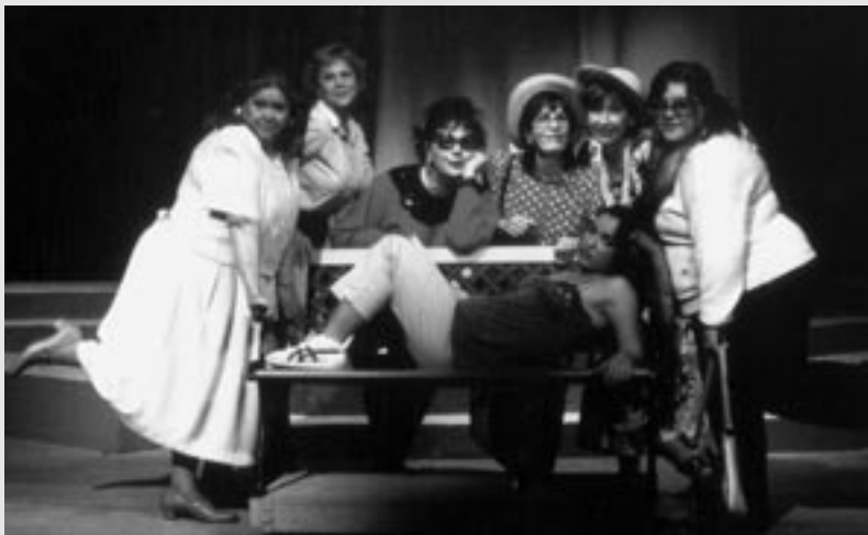
Baby , Winter 2005, Mansfield Campus