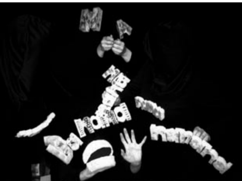
Held Together with Glue and Tape , Spring 2005