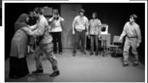
Escuela del Mundo , Winter 2005