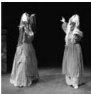
Ghost Stories of the Blacksmith Curse , Autumn 2004