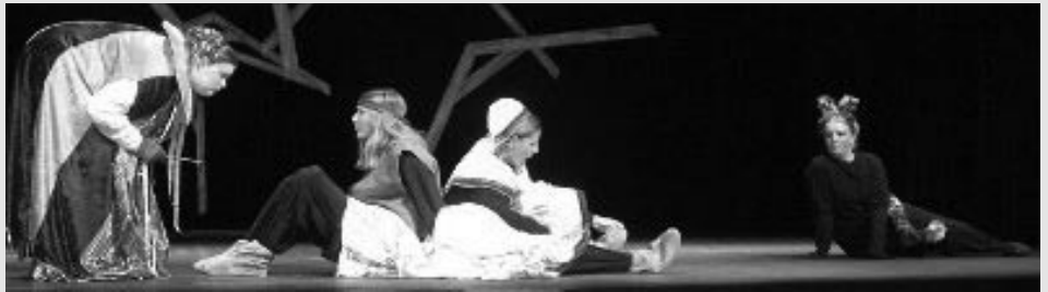
The Blue Bird , Winter 2005, Lima Campus