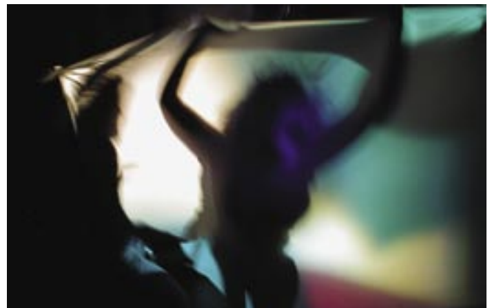
Students experiment during Petr Matásek's Master Class in Autumn 2004.